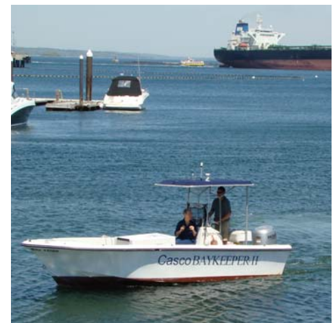
CBEP supports Friends of Casco Bay's Mobile Pumpout Program, which helps recreational boaters comply with Maine's Pumpout Law.