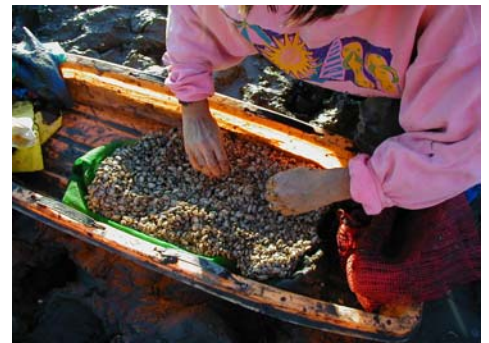
In 2001, CBEP led an effort to test the value of softshell clam farming options by seeding clams in three saltwater "farm" locations along the Bay.