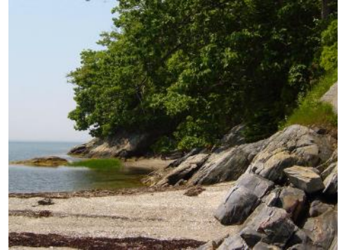
CBEP's Habitat Protection Fund has helped preserve properties such as this one on Pettingill Island.

The amount of permanently protected land in the lower 16 municipalities of the Casco Bay watershed has more than doubled since 1997. That truly remarkable achievement reflects the diligence and hard work of many individuals and organizations throughout the region. CBEP has helped fund some of those efforts through its Habitat Protection Fund (see sidebar, right).