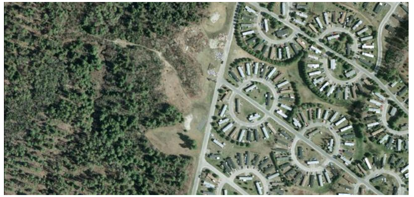
As population increases in the Casco Bay watershed, our pattern of settlement can affect natural resources like wildlife habitat and water quality.

Casco Bay and its watershed continue to provide valuable habitat for a range of fish and wildlife species. But habitat can be lost or degraded by human activity, especially urban and suburban development. Land development also increases impervious cover, causing higher volumes of pollutant-laden stormwater runoff to streams, rivers, and coastal waters.