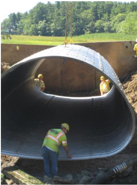
Thomas Bay Marsh was the site of a tidal restoration project in 2011.