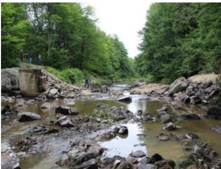
Before (above) and after dam removal at Chandler Brook, Pownal.