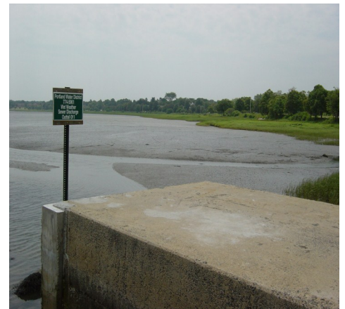
One of Portland’s CSOs located at Back Cove