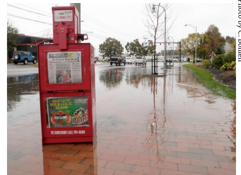
High Tide , Marginal Way , Portland