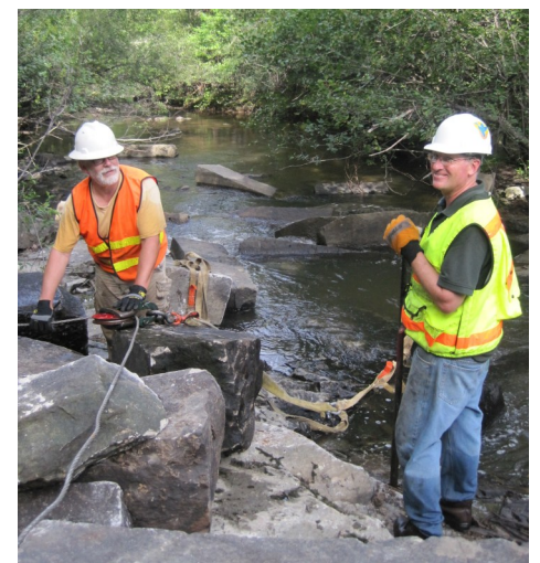
Royal River Rolling Stones Project Fall 2012