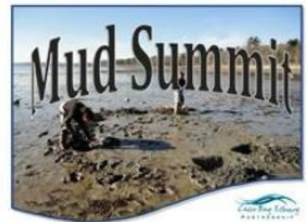
CBEP's 2013 "Mud Summit"

The Casco Bay Estuary Partnership (CBEP) hosted a 'mud summit' to address emerging concerns over coastal ocean acidification and its effect on shellfish resources. The event brought together stakeholders to review the status of related science and available local information, improve understanding of the relationship between pH and shellfish in the Casco Bay region, and help set direction for local and regional efforts to understand the impact of changing pH on Casco Bay shellfish and the shellfish industry.