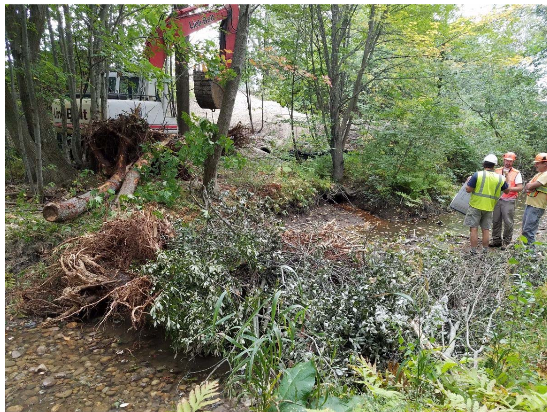
Long Creek contractor and design team reviewing the project plans as they construct a log jam in the Main Stem of Long Creek in South Portland.