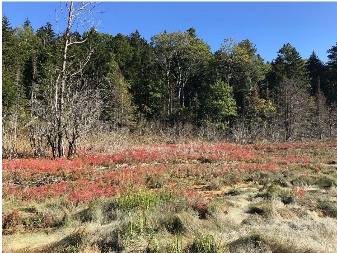
Autumn on Long Marsh, Harpswell

You are receiving this quarterly email newsletter because you signed up for our newsletters in the past. If you wish to unsubscribe, please click the link at the bottom of the newsletter.