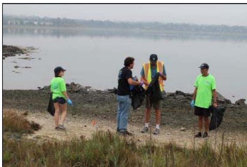
Volunteers with the WCLZ Back Cove Cleanup.