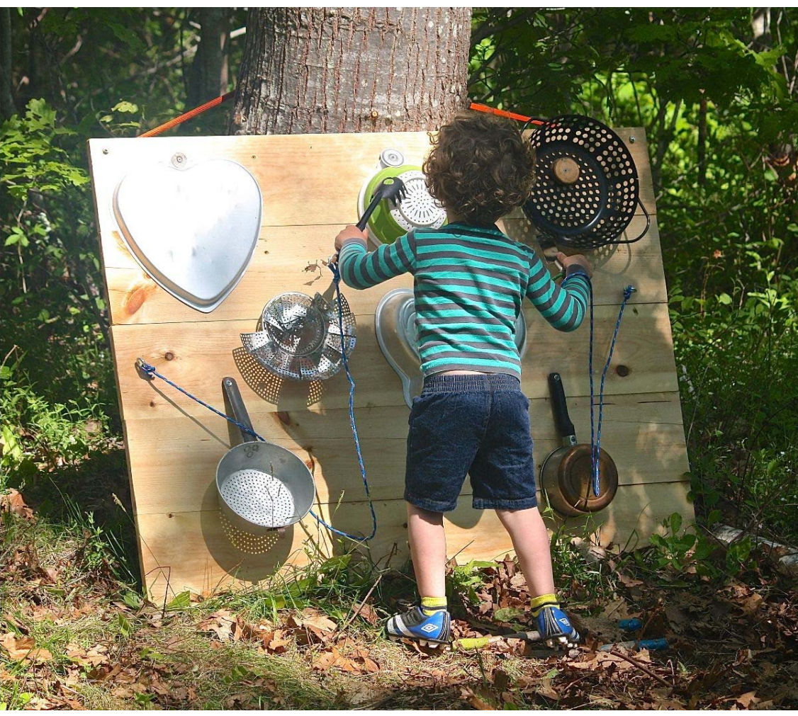
Photo: Harpswell Forest Playground. Photo courtesy of Harpswell Heritage Land Trust.

Casco Bay Estuary Partnership invites proposals for the 2020 Casco Bay Community Grants Program . A total of approximately $11,000 is available in 2020.