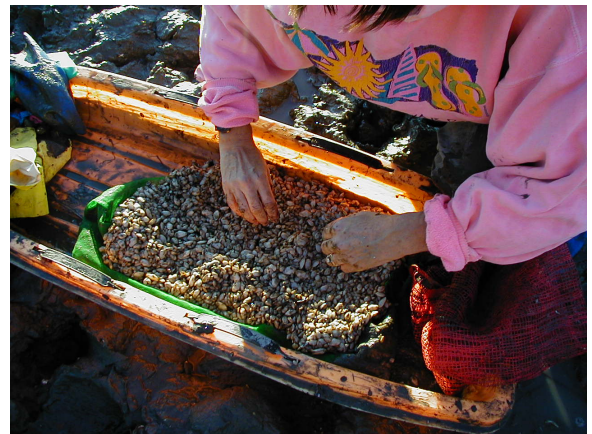
The size of the seeding clams ranges from small (8-10 mm) to large (18-20 mm). In the spring and fall 2002 the surviving clams will be counted and measured to

Management techniques vary significantly between municipalities within Casco Bay and between regions within the state. Most communities with defined shellfish resources to protect do have ordinances that define the responsibilities and goals of the shellfish committee, requirements of license holders, license fees and applicable state regulations. Most towns within Casco Bay do not restrict the amounts of clams that can be harvested per tide by Commercial License holders; all towns do have limits on Recreational diggers. Few municipalities allow nighttime digging, as this is especially difficult to enforce. Conservation time,