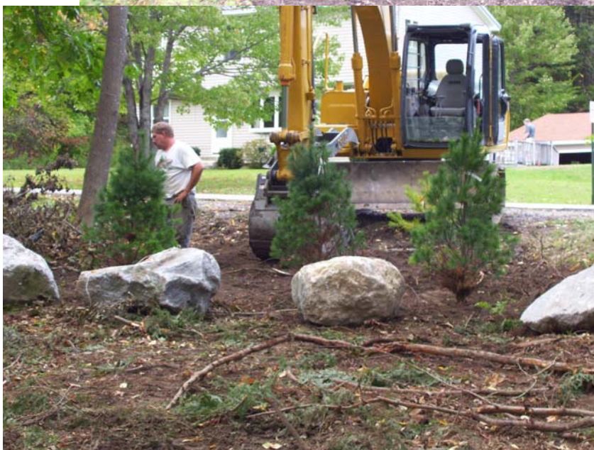
Access/entrance area blocked by boulders and six white pines.