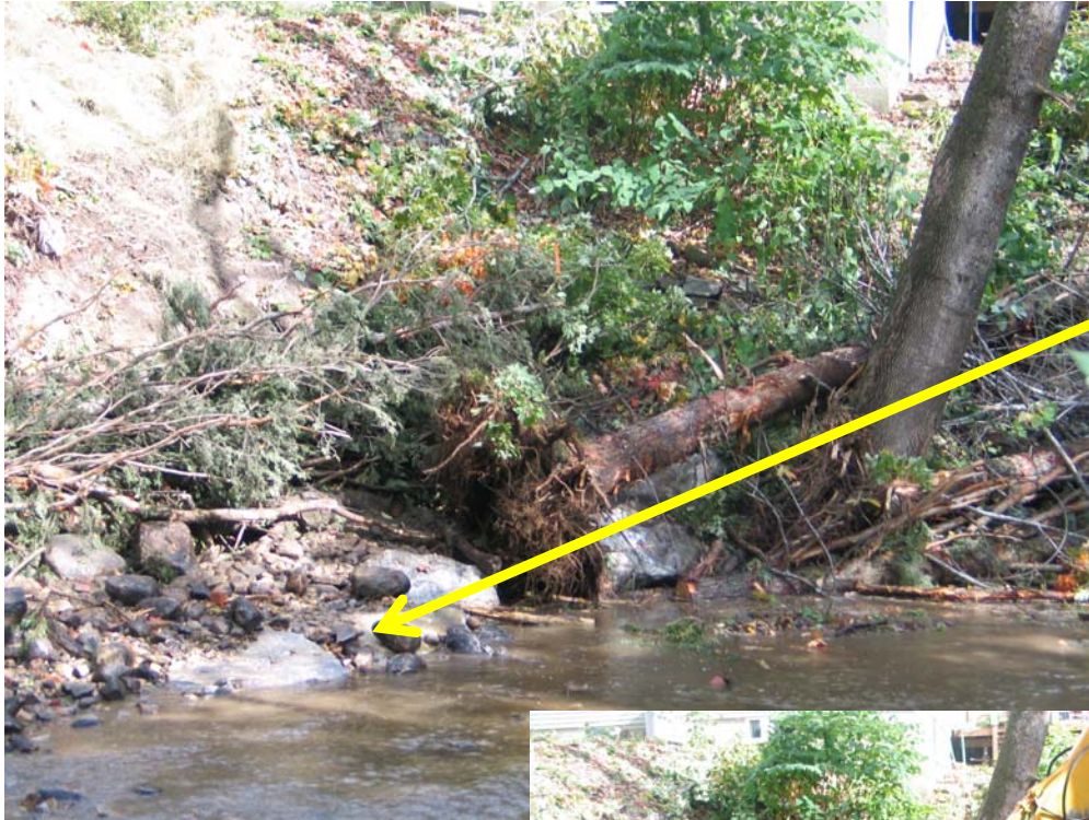
Rock vein with root wads packed around and behind.