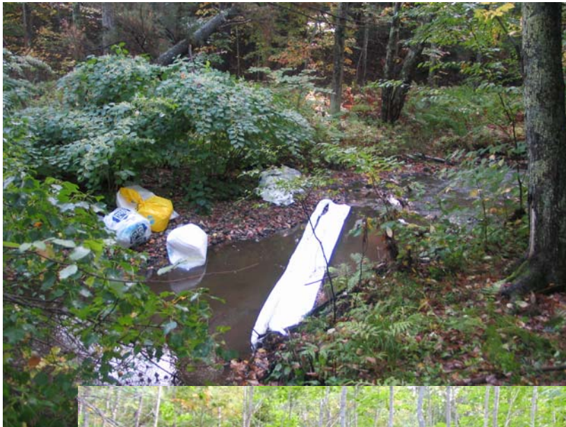
Boom for protection against possible oil/fuel leaks from equipment