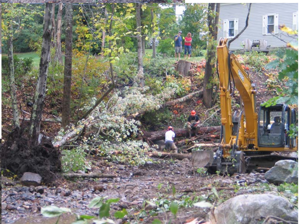
Cable anchoring root wad to live native tree