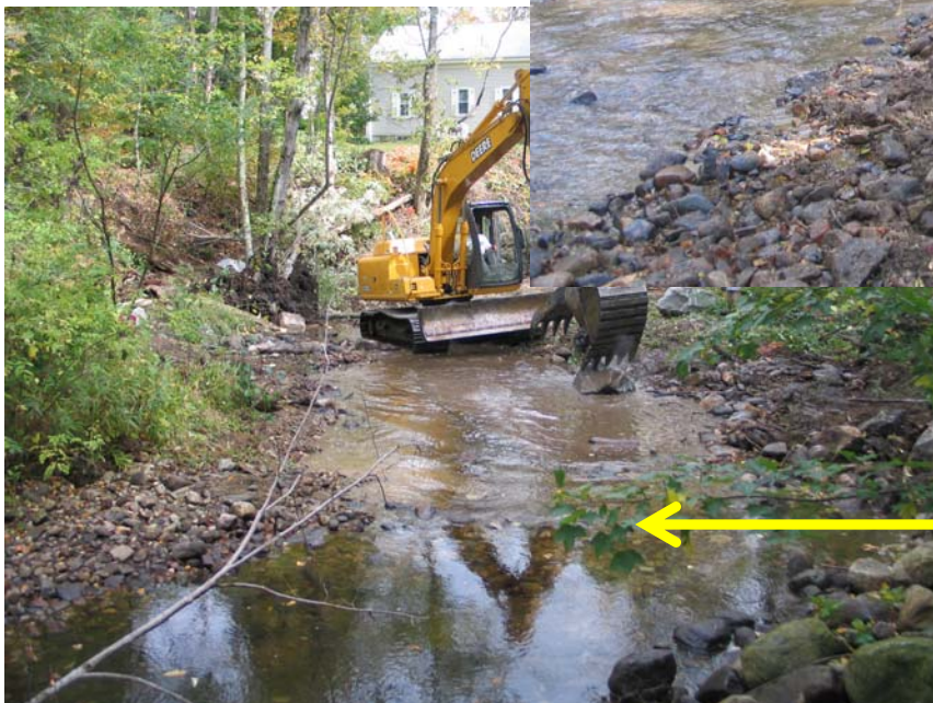
Temporary dam re- moved and feathering of stream bed