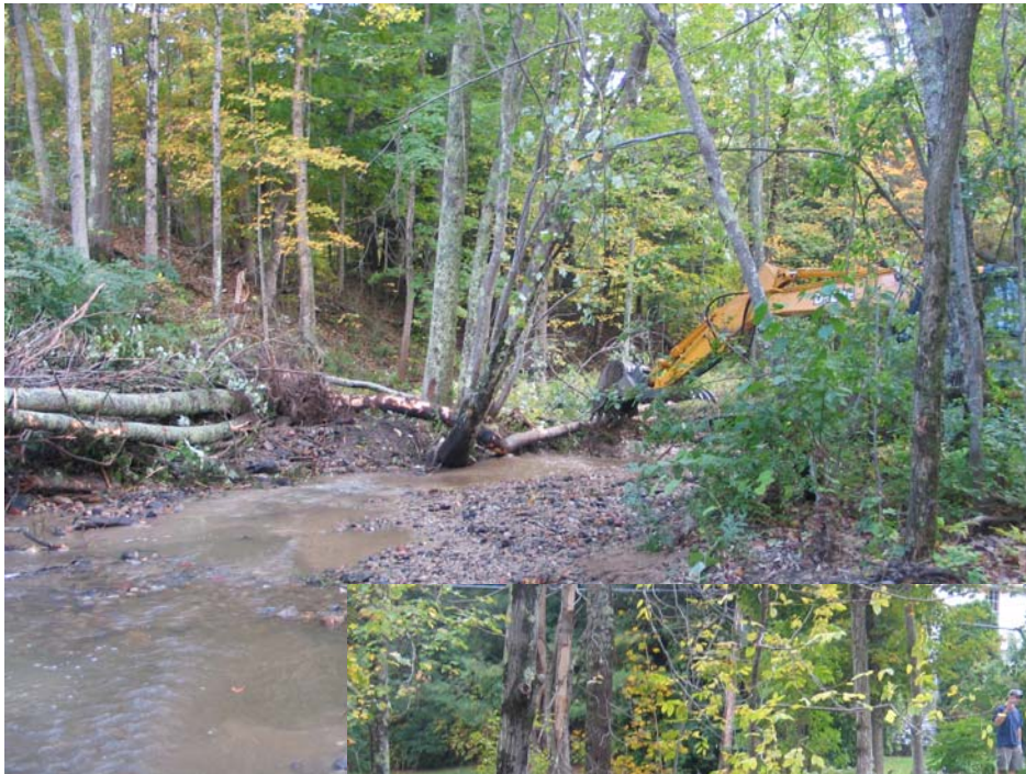
Left - Root wad and native tree stacking.