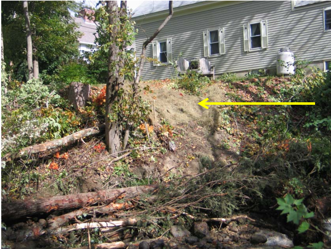
Seeding and Hay bare areas with winter rye