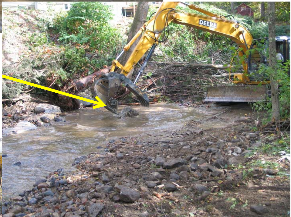
Boulder placement to encourage pool formation and slow velocity.