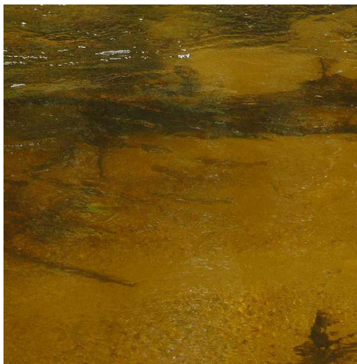
Alewives below a debris jam near Rte 302 -- 5/31/03