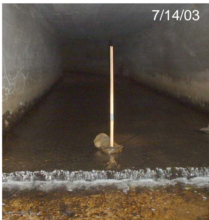
Shallow water (at certain times of year) and flat, concrete bottom.