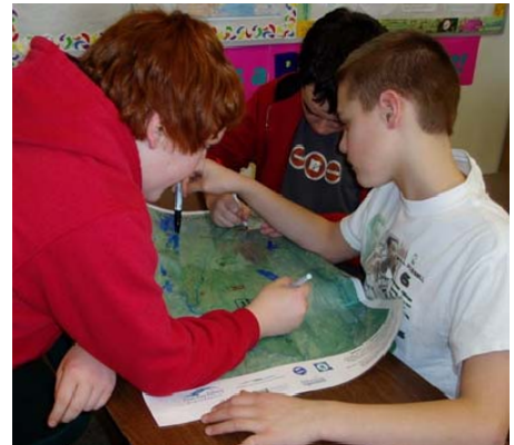
Students work with laminated maps as part of the Maps for Schools Program.