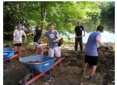
Presumpscot River Youth Conservation Corps members rebuild the canoe launch at Gorham's Shaw Park to prevent further erosion.