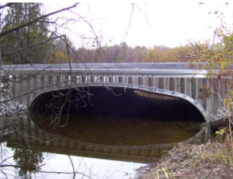
Totten Road crossing of Thayer Brook in Gray. Installation of a bottomless culvert pre- (above), and post- (below) installation.