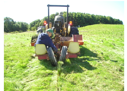
Walnut Crest Farm owner Dale Rines machine plants white and red pines on four acres of pasture along river. Livestock were fenced from the area to promote revegetation.