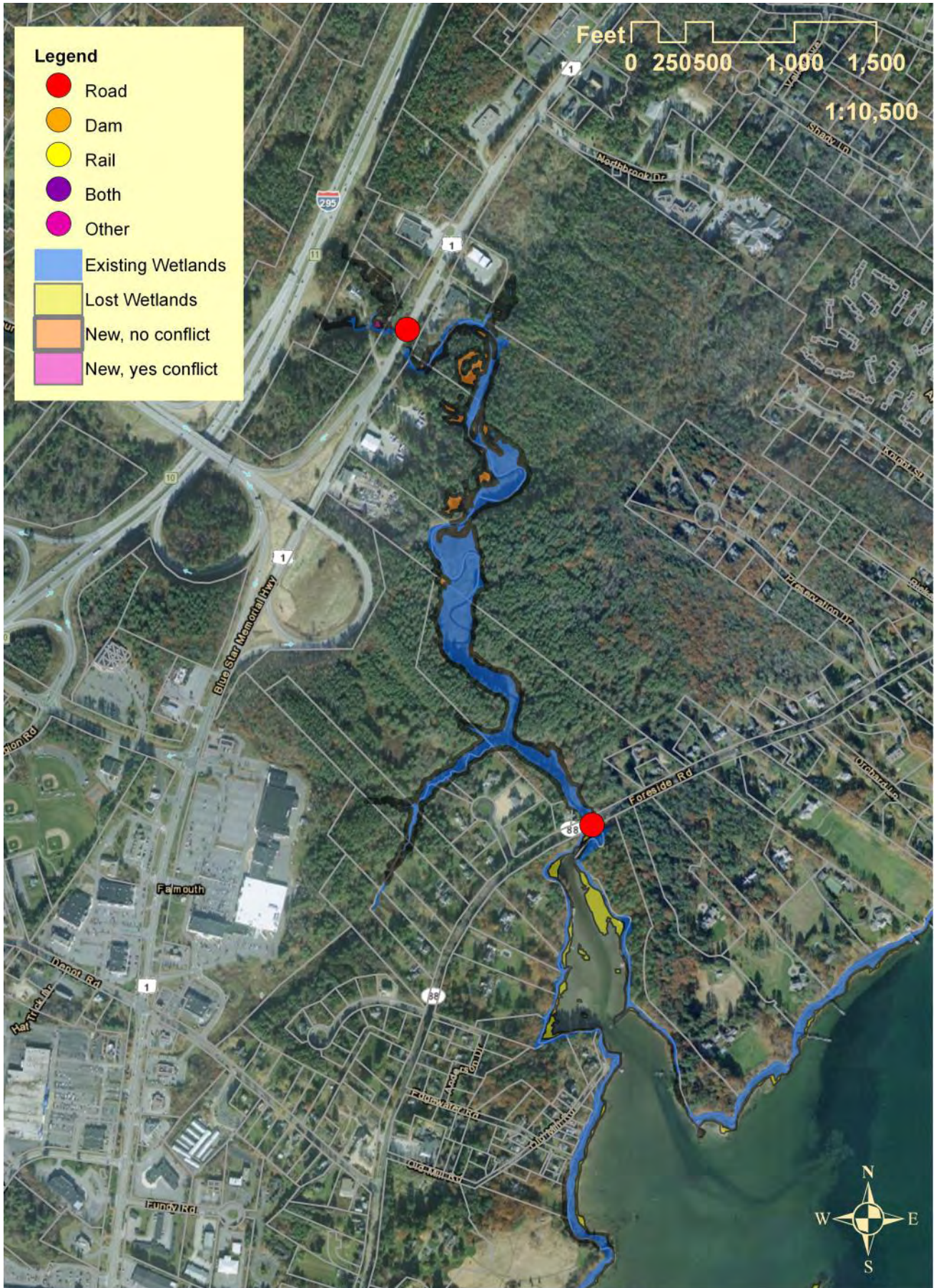
FIGURE 3: Fa1 Foreside Road & Route 1 Area: 1 ft Sea Level Rise