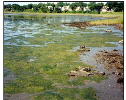
Green Algae Mat