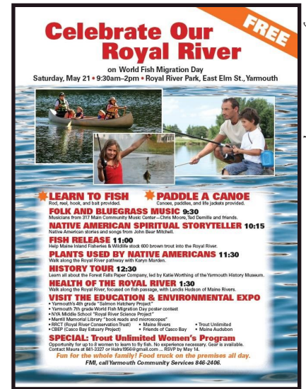
Royal River Alliance poster

Look for more Casco Bay Stories in the future!