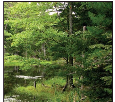
Otter Brook Preserve, Harpswell