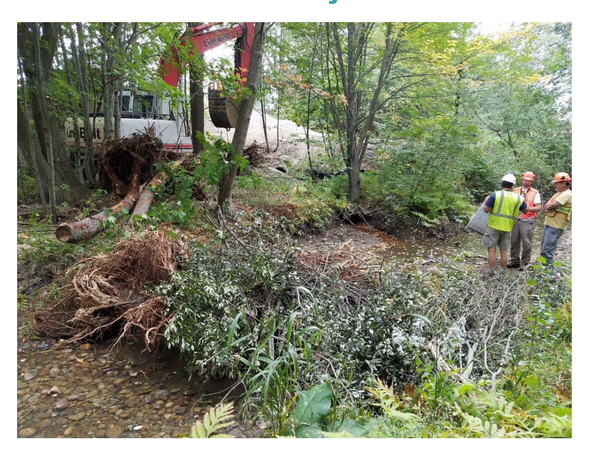
Long Creek contractor and design team reviewing the project plans as they construct a log jam in the Main Stem of Long Creek in South Portland.