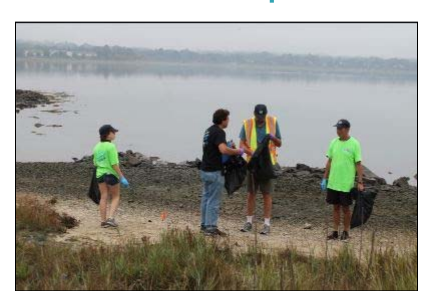
Volunteers with the WCLZ Back Cove Cleanup.

The Maine Coastal Program and partners invite you to join Maine's largest single volunteer event. The Coastal Cleanup includes volunteers of all ages and backgrounds who clean our coastal shoreline and associated waterways of trash. Each year over a thousand participants clear hundreds of miles of thousands of pounds of trash. What is collected is recorded and this data then becomes part of the international ocean trash index which is compiled by Ocean Conservancy. Your efforts continue to ensure that our coastal waters and habitats remain healthy and trash free.