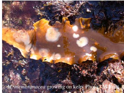
M. membranacea growing on kelp