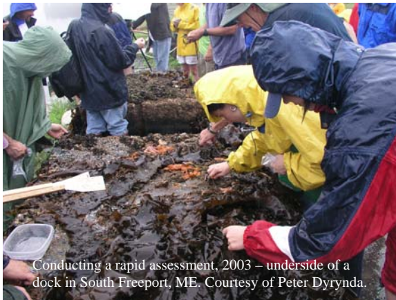
Conducting a rapid assessment, 2003 – underside of a dock in South Freeport, ME.

For all environments (freshwater, land, marine), the U.S. spends a combined $130 billion per year dealing with invasive species problems (Carlton 2001). An alarming example of the impact of a freshwater invasive is the zebra mussel ( Dreissena polymorpha ), which invaded the Great Lakes in 1988 via ballast water, likely from Europe. This species now