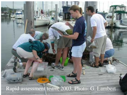
Rapid assessment team, 2003.

The Northeast Aquatic Nuisance Species Panel (NEANS) was established in 2001 under the auspices of the Federal Aquatic Nuisance Species Task Force (ANSTF). Comprised of representatives from government, academia, industry, recreational, utility,