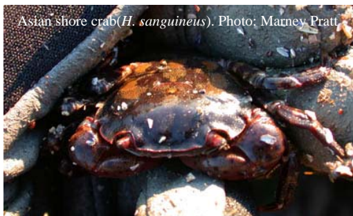
Asian shore crab ( H. sanguineus).

In early 2001 a new dry dock facility constructed in China entered the lower Kennebec River, having traveled through a variety of seas, both tropical and temperate, on its voyage. The potential for accumulating non-native species and introducing them to Maine waters prompted a rapid biological assessment of the hull by its owner, Bath Iron Works. The study was conducted by DMR and Normandeau Associates, with guidance from several invasives experts. Some living non-native species were found during the initial February survey, however, all non-native species were dead by the May follow-up survey, presumably due to cold temperatures and low salinities. While the highly publicized dry dock drew much attention, the more frequent visits of vessels with less notoriety may pose the greater risk of invasions.