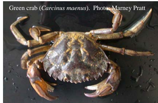
Green crab ( Carcinus maenus ).

Maine's most destructive and costly invader has been the green crab, Carcinus maenus . This crab arrived in the eastern U.S. in the mid-1800's via ballast from the Baltic and North Seas, moving northward and establishing itself in Maine in the early-mid 1900's. The crab has since significantly diminished the soft-shelled clam ( Mya arenaria ) resource, despite extensive efforts by the DMR in the 1950's and 1960's to eradicate it by methods such as fencing, trapping, and applying DDT to mudflats. Population numbers do show decline during periods of exceedingly cold winters (Glude, 1955). This resiliency by the green crab to prolonged and various eradication efforts underscores the extreme difficulty in dealing with marine invasives once they have become established, and the importance of attempting to prevent introductions by being aware of potential vectors and addressing them.