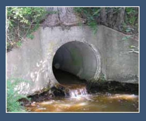
UNDERSIZED CROSSINGS restrict natural stream flow, causing several problems including scouring and erosion, high flow velocity, clogging, and ponding.