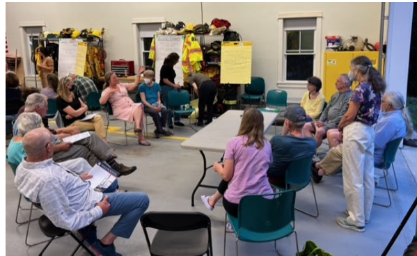
A 2022 Climate Planning Workshop at the Arrowsic Fire Station