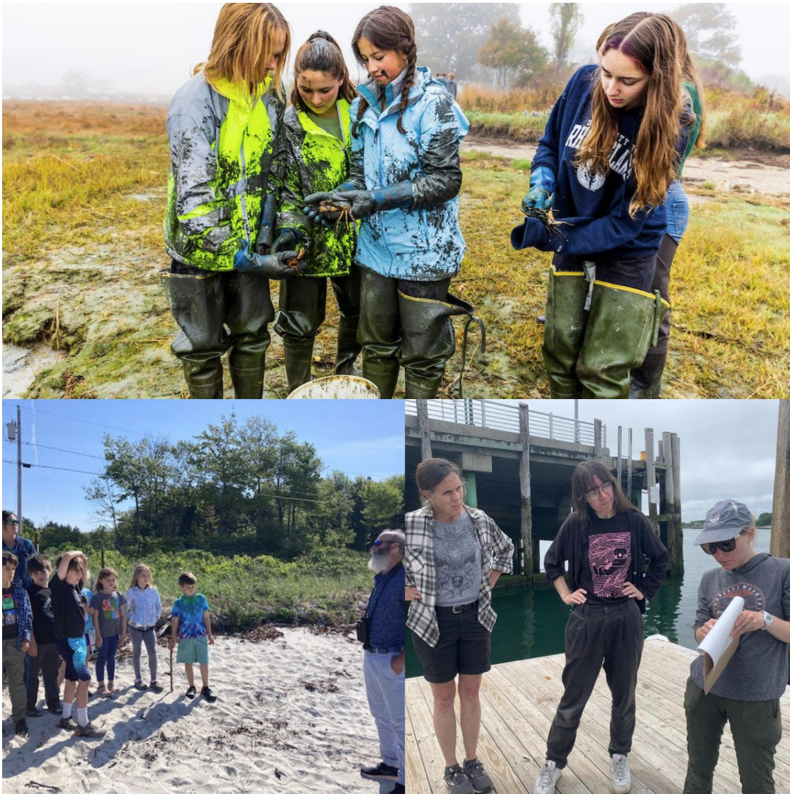
Photos: 2022 Community Grant Projects.