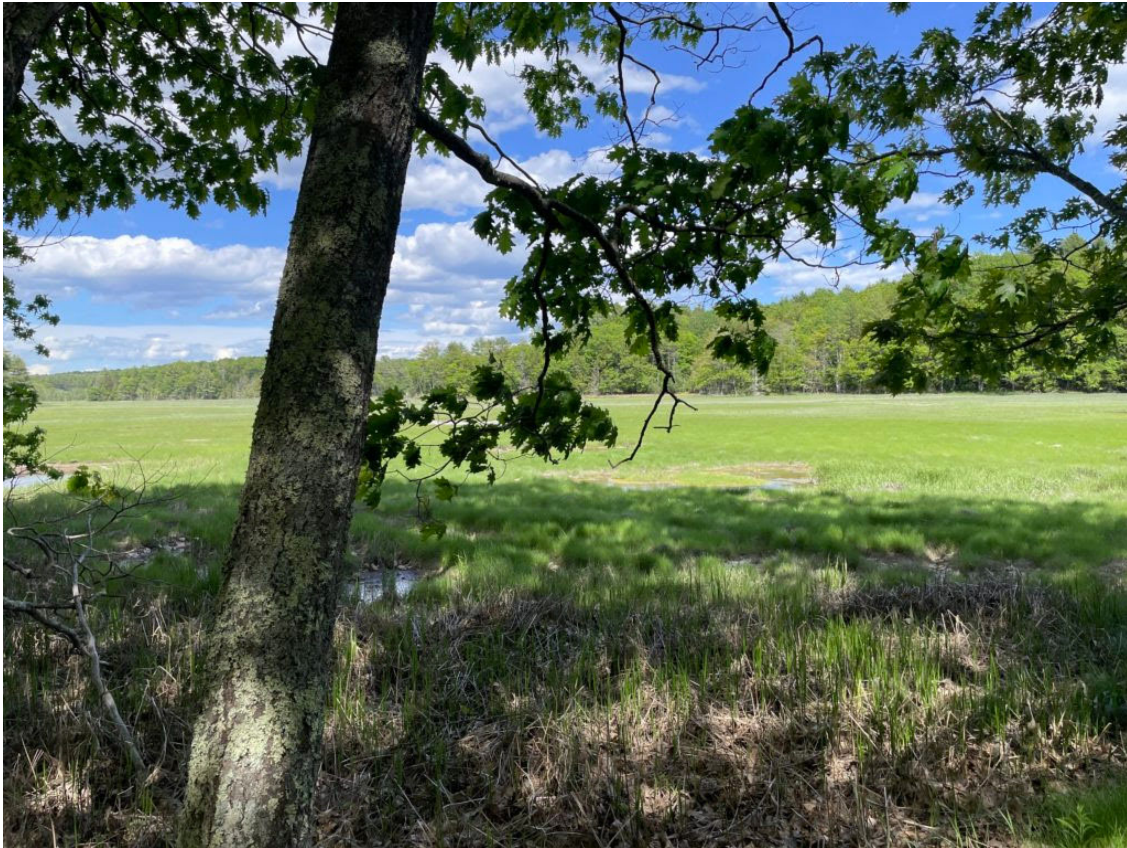
Photo: Cousins River Marsh, 2021 Habitat Protection Fund project

Casco Bay Estuary Partnership requests proposals for its Spring 2023 round of funding to support the permanent protection of targeted habitats in the Casco Bay watershed. Proposals are welcome from land trusts and government entities including municipalities and state agencies.